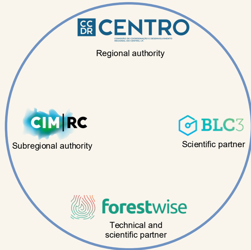
Coimbra Pilot Area