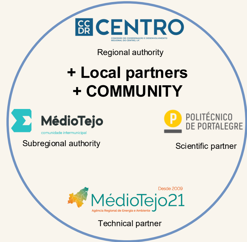
Médio Tejo Pilot Area