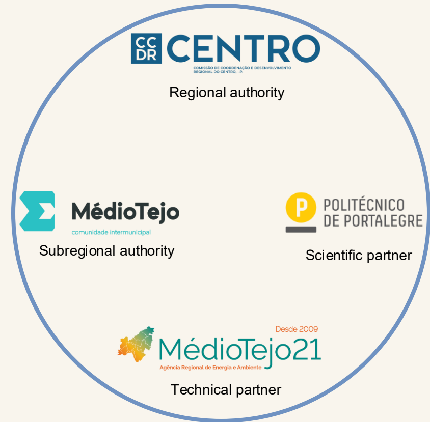
Médio Tejo Pilot Area